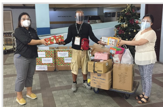
St. Martin de Porres Preschool and Barangay Mariana representative receiving the love boxes donated by Nursery Love and John students.