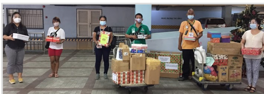
Unang Hakbang Yakap Day Care Center teacher and Barangay Pinagkaisahan officers receiving the love boxes donated by Kinder Abraham and Faith students.

We collected 538 kilograms of assorted school supplies, toys, clothes, health kits and grocery items and a cash donation amounting to Php 7,500.00.