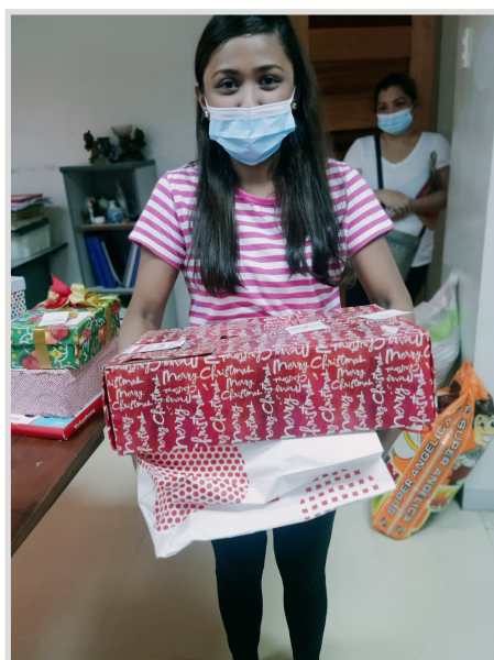
A parent from St. Martin de Porres Preschool is thankful for the gifts.

The students, parents, and teachers of Unang Hakbang Day Care Center, Hill Crest Day Care Center, and St. Martin de Porres Preschool are grateful for the blessings you and your children have shared with them.