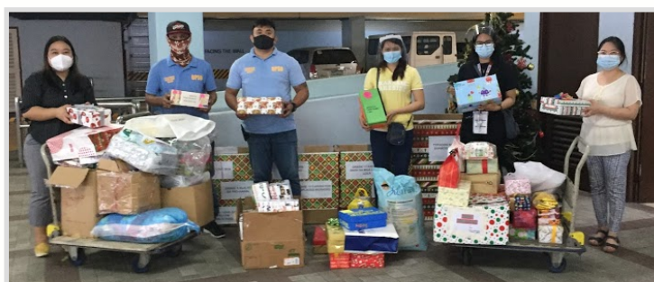
Hill Crest Yakap Day Care Center representatives and Barangay Conception officers receiving the love boxes donated by Kinder Noah and Hope students.