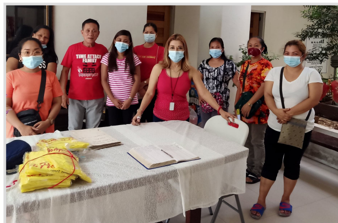
Barangay Mariana officials distributing the love box donations to the parents of St. Martin de Porres Preschool.