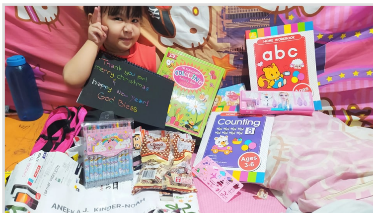
A student from Hill Crest Yakap Day Care Center is thankful for her gifts.